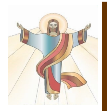
Sharing the Spirit Together in Christ