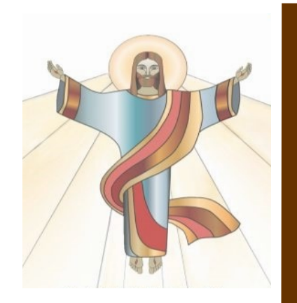
Sharing the Spirit Together in Christ